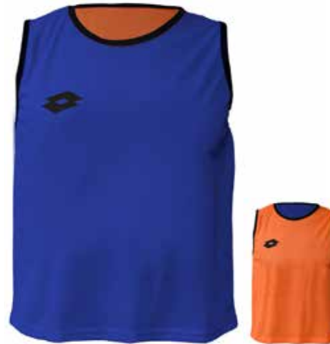
59338 ROYAL / ORANGE