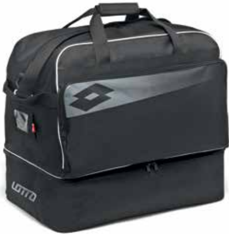
S3886 BLACK/GREY CEMENT