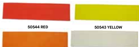
50544 RED 50543 YELLOW 50541 ORANGE 50542 WHITE