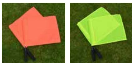
ORANGE 69072 YELLOW 69073