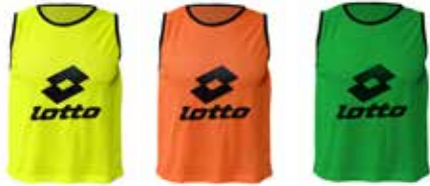
59420 FLURO YELLOW