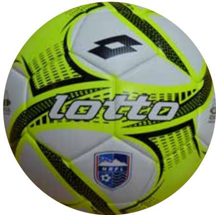
VT355 YELLOW SAFETY / BLACK