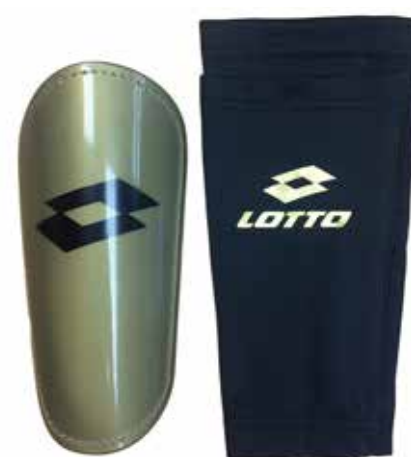
S2603 GOLD / BLACK