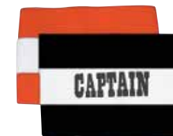
52998 RED 52996 BLACK