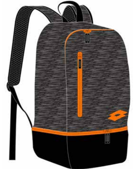
211536_1UK ORANGE/ BLACK MARL