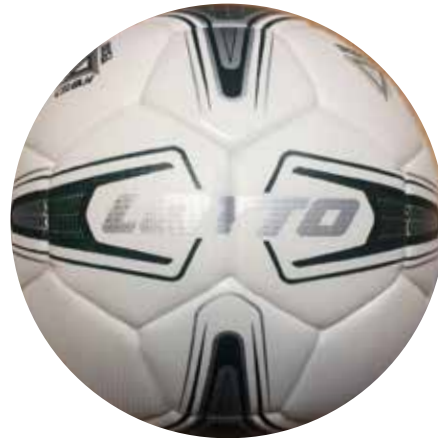
N5435 FOREST GREEN / METALLIC SILVER