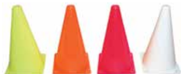
50502 YELLOW 50501 ORANGE 50499 RED 50500 WHITE