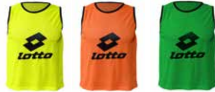
59520 FLURO YELLOW