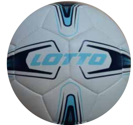
53362 NAVY / AQUA