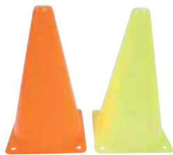
50510 ORANGE 50511 YELLOW